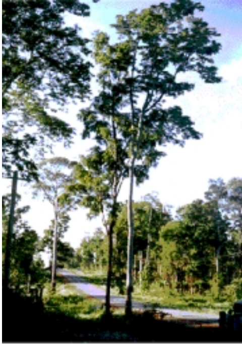
Naturally occurring tree in a national park, north-eastern Thailand.

The seedcoat of this species is so hard that pretreatment with boiling water may not be sufficient to break the dormancy. Furthermore, the large aril delays germination and must be removed. Using a sharp knife, it is possible to cut off the aril together with a small chip of the seedcoat but care must be taken not to damage the radicle. If the seed coat is not scarified while removing the aril, the seed should be nicked at the opposite end. After cutting, the seeds are soaked in water for 12 hours before sowing.