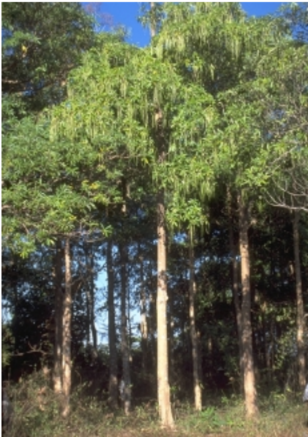
Fruiting trees in plantation. Laos.

Fresh seeds are not dormant and pretreatment is not necessary. The possibility of a secondary dormancy needs investigation.